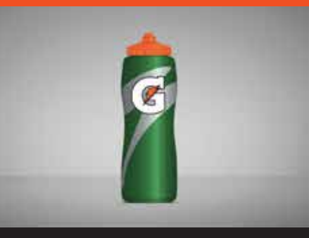
A sideline staple, helping to keep athletes hydrated and fueled so they can perform at their peak.