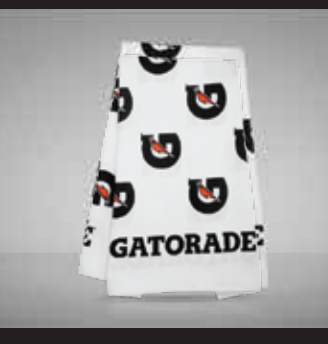
Quickly absorbs what players sweat out, with lightweight cotton construction and dimensions ideal for draping around the neck.